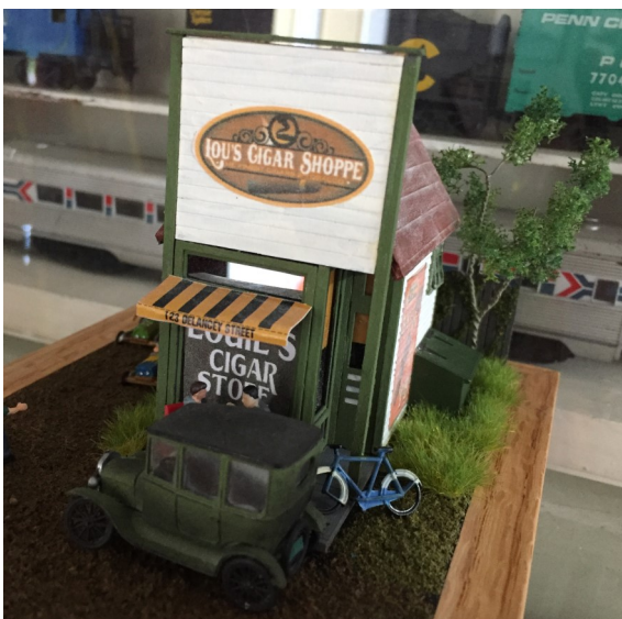
Above is Dale's cigar store and to the right is Sam's tower

The August contest will be freight cars.